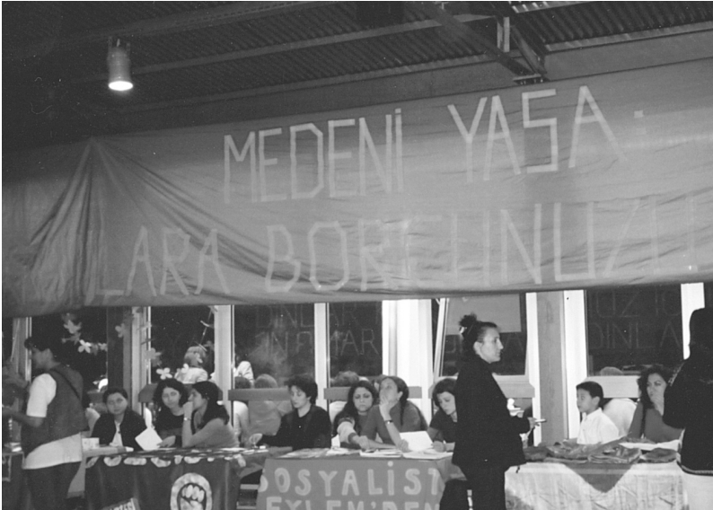
WOMEN'S FESTIVAL, MARCH 8 TH , 2002. "CIVIL CODE: SETTLE YOUR DEBTS TO WOMEN."

The law specifies a minimum share of the deceased's estate, which must go to the surviving spouse, children, parents or grandparents (Article 506 of the Civil Code).