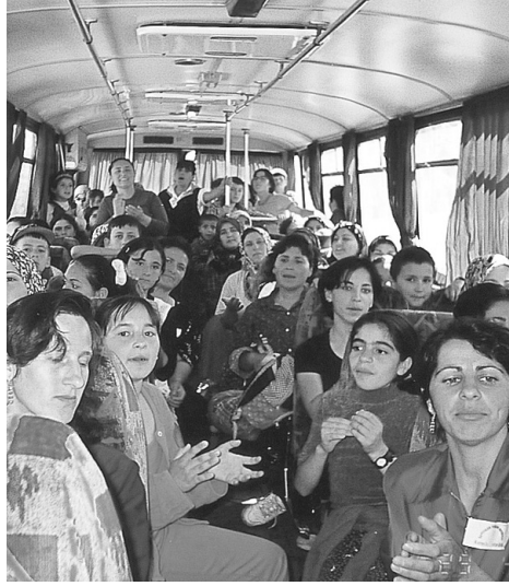
CELEBRATING THE NEW CIVIL CODE ATTAINED THROUGH JOINT ACTION BY WOMEN'S GROUPS.

Place of residence: With the new Civil Code, spouses jointly choose where they will live (Article 186 of the Civil Code). This is a positive change from the old clause, which assigned the decision-making power concerning place of residence to the husband. Besides, the clause that the wife's place of residence is the residence of her husband has been deleted from the definition of legal domicile. Under Turkish law spouses have to live together (Article 185 of the Civil Code).